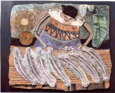
Nelfa Querubin-Tompkins , left: Abstract Landscape , 2001, white clay, stains, glazes, fired high in gas, 18x17x5 inches; above: Fish vendor , glazed clay (other data unavailable)